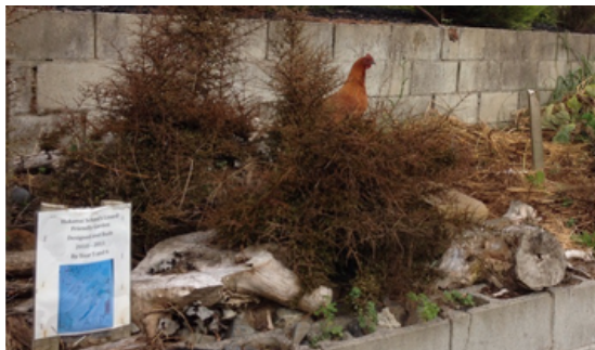
Garden created by the children