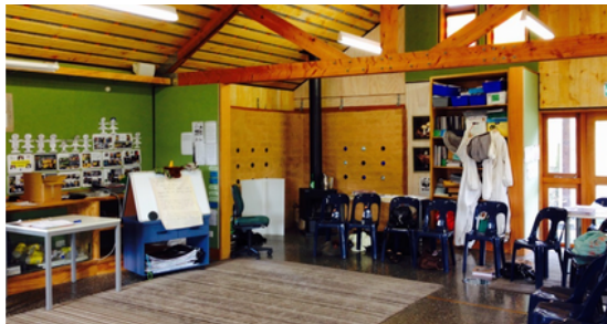
Students experimented with various materials to create these heat retaining bricks pictured here behind the stove