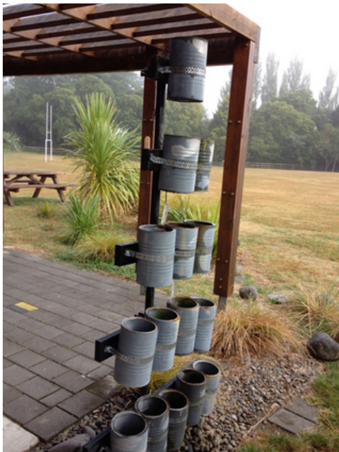
Student-designed rainwater collection system