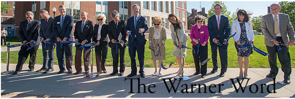
The E-Newsletter of the Warner School of Education at the University of Rochester